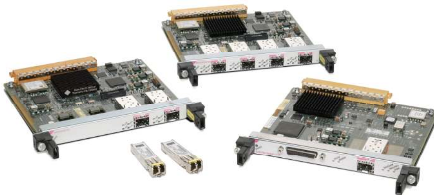
Figure 1. Cisco 2-Port OC-48c/STM-16c POS/RPR SPA with SFP Optics

The Cisco 1-, 2-, and 4-Port OC-48c/STM-16c POS/RPR SPAs are available on high-end Cisco routing platforms and offers the benefits of network scalability with lower initial costs and easy upgrades. The SPAs continues the Cisco focus on investment protection along with consistent feature support, broad interface availability, and leading-edge technology. The SPAs allow different interfaces (POS, ATM, etc.) to be deployed on the same carrier card.