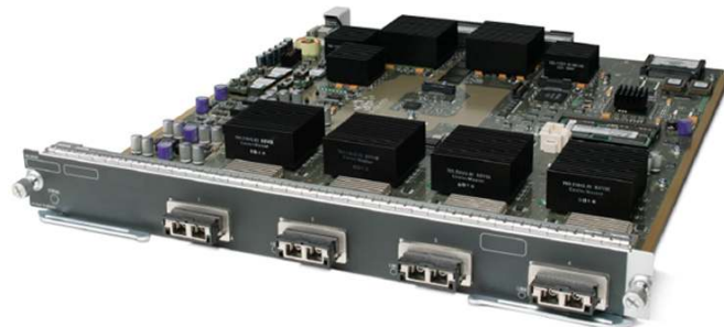
Figure 7. Cisco MDS 9000 Family 4-Port 10-Gbps Fibre Channel Switching Module

Cisco MDS 9000 Series supports 10-Gbps Fibre Channel switching with the Cisco MDS 9000 4-Port 10-Gbps Fibre Channel switching module. This module supports hot-swappable X2 optical SC interfaces. Modules can be configured with either short-wavelength or long-wavelength X2 transceivers for connectivity up to 300 meters and 10 kilometers, respectively. Figure 5 shows the Cisco MDS 9000 Family 4-Port 10-Gbps Fibre Channel switching module.