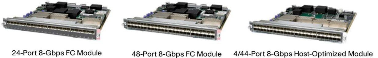
Figure 4. Cisco MDS 9000 Family 8-Gbps Fibre Channel Switching Modules