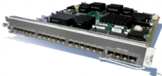
Figure 6. Cisco MDS 9000 18/4-Port Multiservice Module