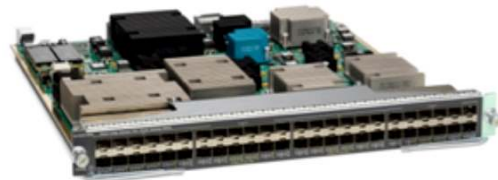
48-port 8-Gbps Advanced FC Module