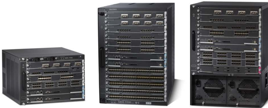
Figure 1. Cisco MDS 9500 Multilayer Directors

Addressing the stringent requirements of virtualized data center storage environments with high availability, scalability, intelligence, ease of management, and support for seamless deployment of converged Fibre Channel (FC) and Fibre Channel over Ethernet (FCoE) Fabrics.