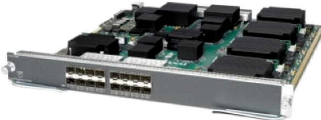
Figure 5. Cisco MDS 9000 16-Port Storage Services Node

The Cisco® MDS 9000 16-Port Storage Services Node (Figure 5) provides a high-performance, flexible, unified platform for deploying enterprise-class disaster recovery, business continuance, and intelligent fabric applications. The 16-Port Storage Services Node offers Fibre Channel over IP (FCIP) for remote SAN Extension, Cisco IO Accelerator (IOA) to optimize the utilization of Metropolitan and Wide Area Network (MAN/WAN) resources for backup and replication using hardware-based compression, FC write acceleration, and FC tape read and write acceleration, and Cisco Storage Media Encryption (SME) to secure mission-critical data stored on heterogeneous disk, tape, and VTL drives. The Cisco MDS 9000 16-Port Storage Services Node hosts four independent service engines, which can each be individually and incrementally enabled to scale as business requirements change, or be configured to consolidate up to four fabric application instances to dramatically decrease hardware footprint and free valuable slots in the MDS 9500 Director chassis.