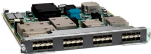
32-port 8-Gbps Advanced FC Module