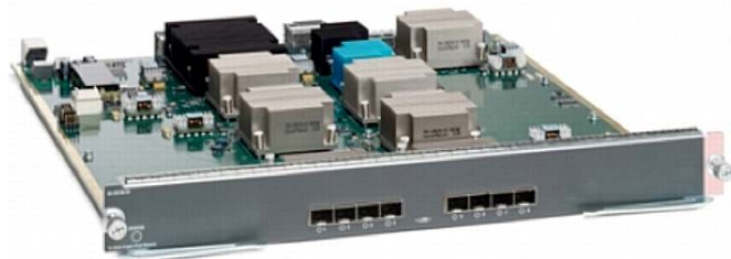
Figure 3. Cisco MDS 9000 Family 10-Gbps 8-Port FCoE Module