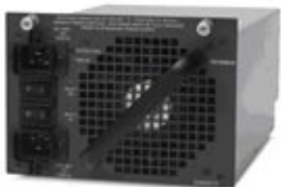
Figure 1. 4200W AC Dual Input

One of the compelling advantages of implementing Power over Ethernet (PoE) for voice over IP (VoIP) is the ability to converge multiple networks. A single network simplifies power backup, maintenance, and monitoring, while extending the high availability of traditional voice networks to the data network. This at-a-glance provides a high-level view of PoE high availability on Cisco® Catalyst® 4500 E-Series Switches.